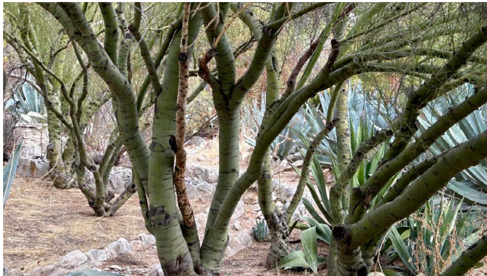
Neighborhood wash with native trees and plants