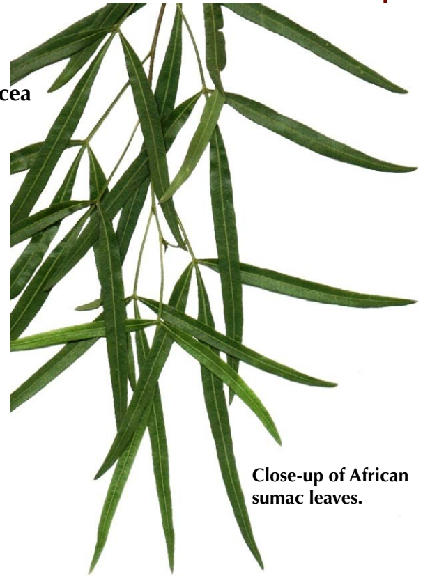
Close-up of African sumac leaves.