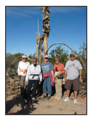
Saguaro East Boardway Trailhead

ADA compliant handrails are installed at both Adelita and Caballo.