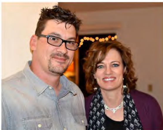
Clockwise from top left: