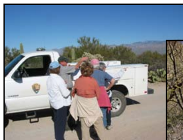
Ok, so we get lost once in a while