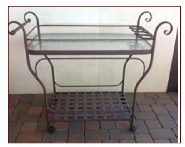
O.W. Lee Serving Cart: $100 (Current retail price: $1000)