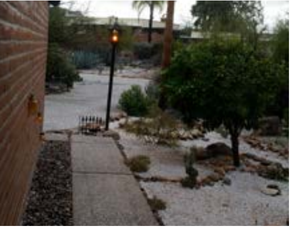
Recent hail in the Pueblo

If you run into one of our great committee members, please give them a big thank you. Their support helps your Board do a better job.